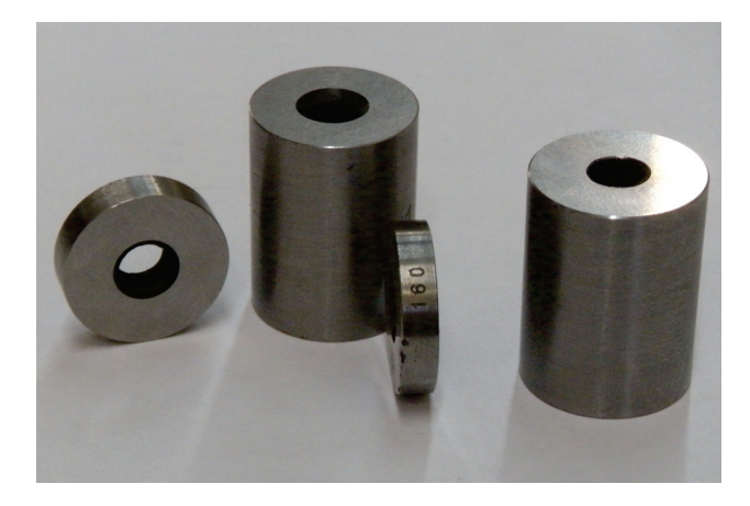
Fig. 1 Representative cylindrical gauge blocks

The standard used as the "standard value" generally is a National Institute of Standards and Technology (NIST) traceable length standard with an absolute tolerance defined by the reference standard and class. A length reference is normally a gauge block. A gauge block is a piece of metal having flat and parallel opposing gauge surfaces (Fig. 1). A grade 2 NIST 100 mm gauge block matches the NIST reference standard to +0.0003/–0.00015 mm, but only at the standard conditions:<sup>[2]</sup>