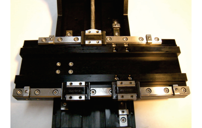
Fig. 3 Typical X-Y movement mechanism with the X axis stage removed. There are three bearings instead of four on each axis, although the runout and orthogonality effects are the same as in the text.

Determining axis uncertainty requires knowing the geometric relationships of all three axes and the rotational